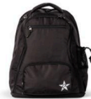
STRIKE DREAM BAG $76.50