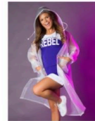
REBEL RAINCOAT $15.00