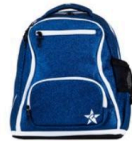
CHOOSE FROM ANY IN-STOCK DREAM BAG WITH $113 MSRP $99.00