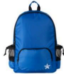
RAVEN BACKPACK $57.50