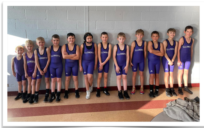
Youth wrestlers at the Glenwood City Reindeer Rumble.

We had a very good youth season with well over 50 kids going out in kindergarten thru 5th grade.