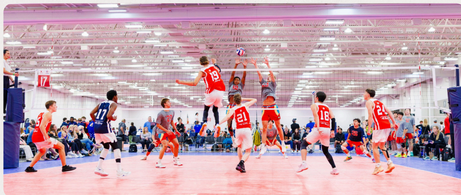
CLASS of 2026 NCR SCHOLARSHIP APPLICATION OPENS MARCH 15

Junior Player Awards Open April 15 and close May 30 .