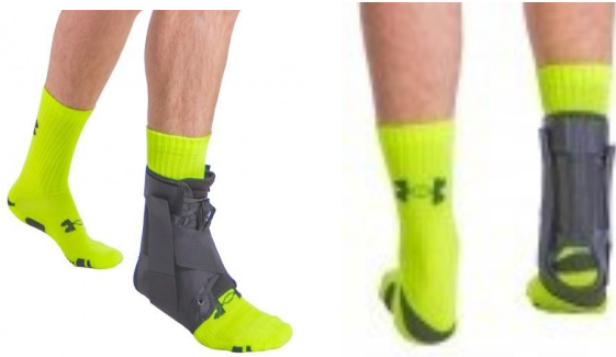
Figure 8 Lace-up Ankle Brace