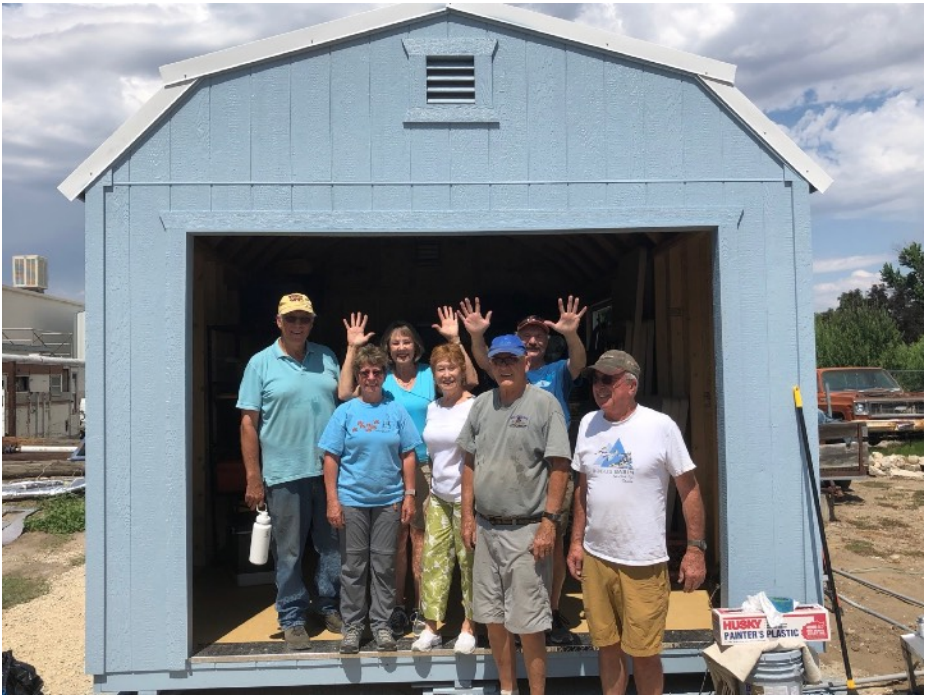
Volunteers who helped out with moving BBSC equipment from the old rented storage space to the new storage shed.