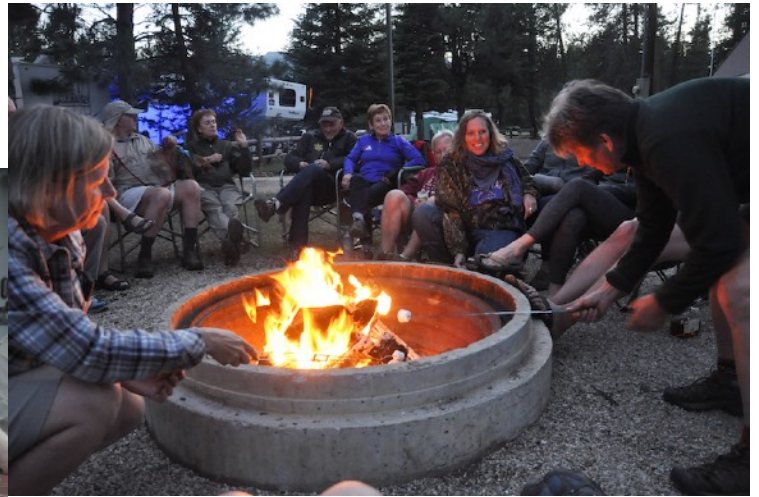
Favorite campfire S'mores.