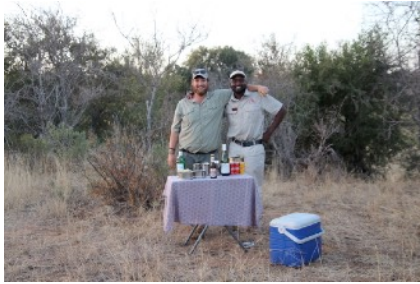
Our driver & spotter with snacks & beverages twice every day.

During every morning and afternoon game drive, our driver and spotter would stop the vehicle in a clearing, set up the snacks and beverages, and serve us while we stretched our legs and warmed ourselves up (in the mornings) or enjoyed a sundowner (a beverage consumed while watching the sun set) in the evenings.