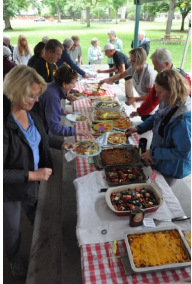
Casseroles set out for judging.

Our much-anticipated annual Champagne Brunch took place on Sunday, September 8 th . In spite of a weather forecast for a rainy day, 75 members and guests showed up to a really good time with the usual bounty of delicious casseroles, pastries, fruit and mimosas.