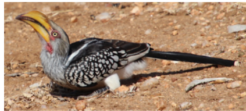
The Yellow Hornbill tosses its food into the air then catches it...fun to watch.