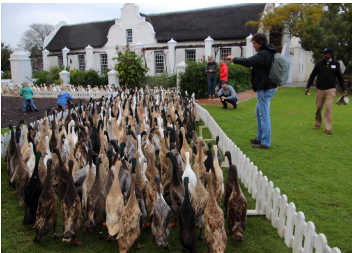
Daily duck parade at Vergenoegd Wine Estate.

Time to head to Cape Town for our final four nights. Cape Town was voted The Best City in the World in 2018 by Britain's Daily Telegraph. Although we spent most of our time exploring outside of the city, while we were in town, it did not fail to live up to its reputation. We visited Vergenoegd Wine Estate outside of Stellenbosch to enjoy some samplings, as well as their daily duck parade. The Indian Runner Ducks have been there for many generations and parade daily as they make their way out to the vineyards to do "bug patrol."