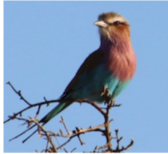
We saw Lilac Breasted Ropplers on almost every game drive.