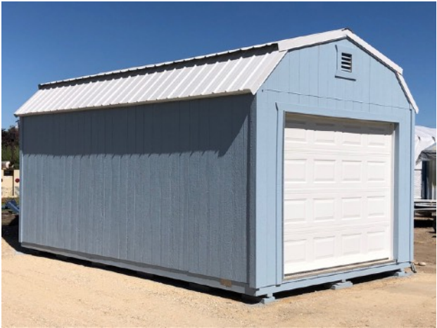
New BBSC storage shed.