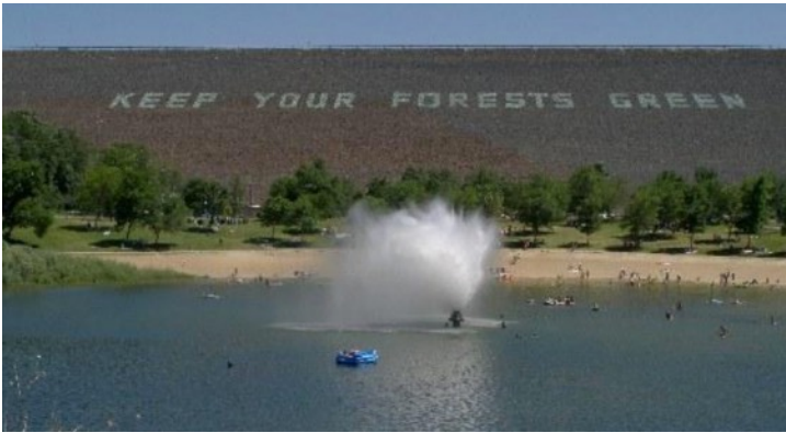
Lucky Peak Dam