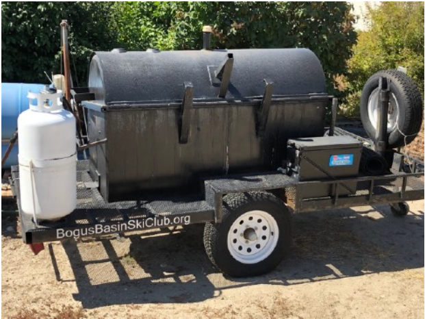
Big Bertha will be housed in the shed as soon as the new ramp is built.