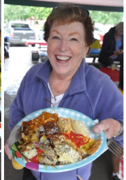
Samples from which to judge.