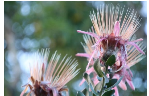
Protea, the official flower of South Africa.

Gardens near Cape Town one afternoon. The Protea is the official flower of South Africa and many varieties were in bloom. The area near Cape Town is in the middle of a plant kingdom that exists nowhere else on earth, the Fynbos. We saw plants that are found nowhere else.