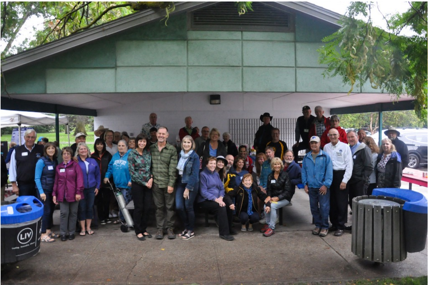
Of the 75 who attended this event these were those who stayed until the end when this group photo was taken.