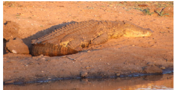
Wherever there was water, there were crocodiles.