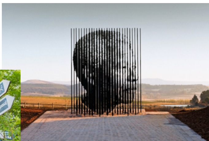
Mandela Memorial in Howick, South Africa.