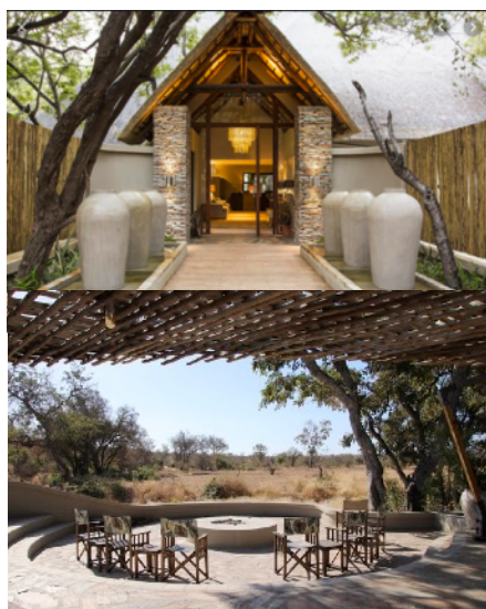
Amani Safari Camp

From Johannesburg, we flew to Hoedspruit then drove to Amani Safari Camp, which is outside of Kruger National Park in a private game preserve. It's a small camp so we were the only guests there and we were treated like royalty. The chef was a gourmet chef, so the food was superb. We went on both a morning and an afternoon safari game drive every day and had the late mornings and early afternoons to spend however we wanted to at the camp. We chose to hang out beside the pool across the river from the watering hole where animals would come to drink 24 hours a day. The