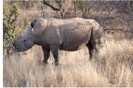
White Rhinos have been dehorned at the private reserves to keep poachers away.