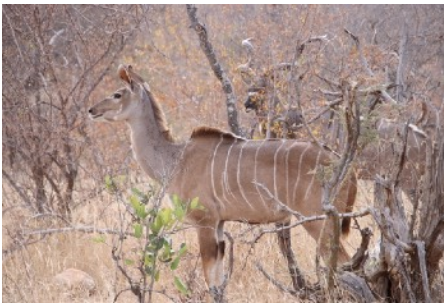
Kudu are prolific.