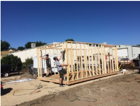
Walls going up.

A big thank you goes to Stor-Mor Sheds. They built the shed on site and provided it at a discount for the club. The overhead garage style door was donated by Ron Raush and installed by Excello Overhead Door at half their regular rate!