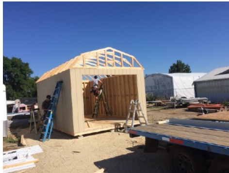
Rafters and siding on.