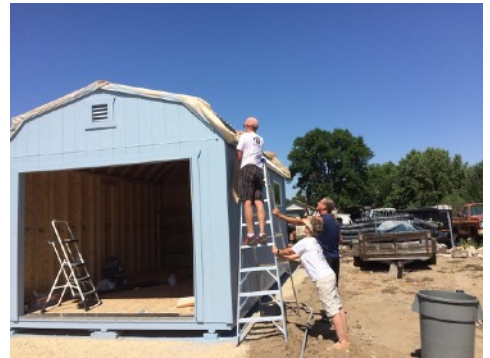
Masking and painting.