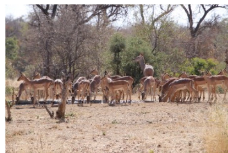
Kudu & impala at the watering hole across the stream from Amani.