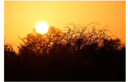
Typical sun set.

During every morning and afternoon game drive, our driver and spotter would stop the vehicle in a clearing, set up the snacks and beverages, and serve us while we stretched our legs and warmed ourselves up (in the mornings) or enjoyed a sundowner (a beverage consumed while watching the sun set) in the evenings.