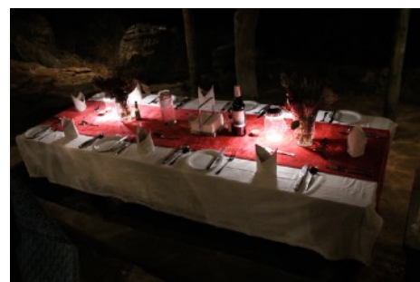
Typical evening meal prepared by our gourmet chef.

From Johannesburg, we flew to Hoedspruit then drove to Amani Safari Camp, which is outside of Kruger National Park in a private game preserve. It's a small camp so we were the only guests there and we were treated like royalty. The chef was a gourmet chef, so the food was superb. We went on both a morning and an afternoon safari game drive every day and had the late mornings and early afternoons to spend however we wanted to at the camp. We chose to hang out beside the pool across the river from the watering hole where animals would come to drink 24 hours a day. The