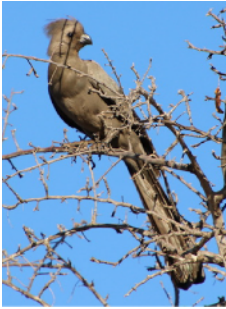
The Go Away bird whose call literally sounds like it is yelling "Go Away!"

The animals were what all the game drives were about. At the final count, we saw at least 267 different bird species and at least 66 mammal species. We witnessed a pride of female lions stalking and eating an impala, lions mating, lion cubs chewing on their dad's tail, leopards hunting, cheetahs relaxing with full stomachs, antelopes sparring, buffalo grazing, and on and on! Enjoy a few!