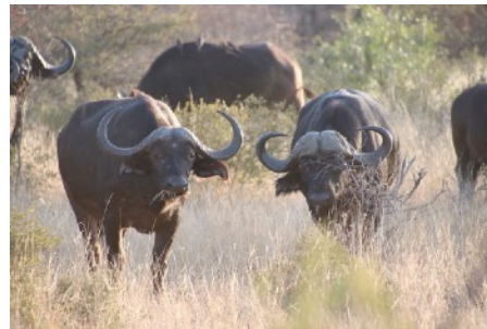
Cape Buffalo kill more humans than any other animal.