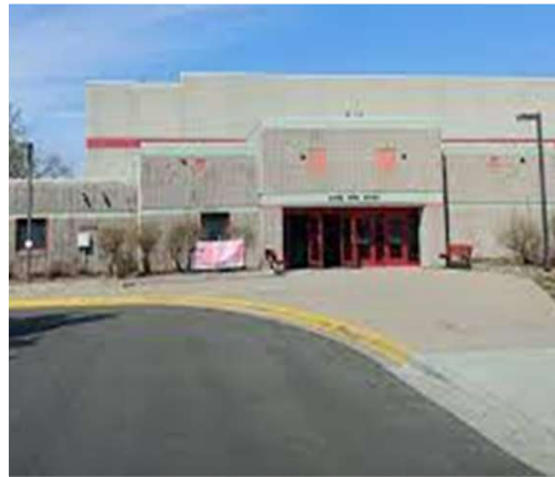
Hayes Ice Arena