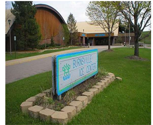
Burnsville Ice Center "BIC1 & BIC2"