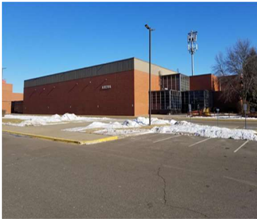
Apple Valley High School (Sports Arena) "AVSA"