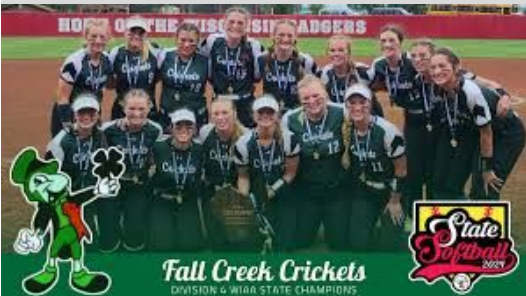
Fall Creek Crickets DIVISION 4 WIAA STATE CHAMPIONS