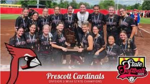
Prescott Cardinals DIVISION 3 WIAA STATE CHAMPIONS