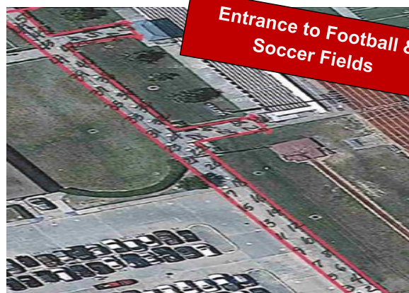
Entrance to Football & Soccer Fields