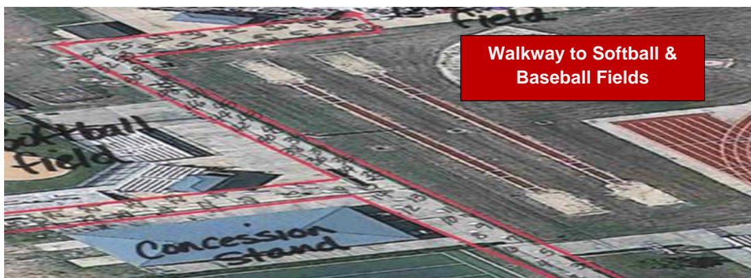
Walkway to Softball & Baseball Fields