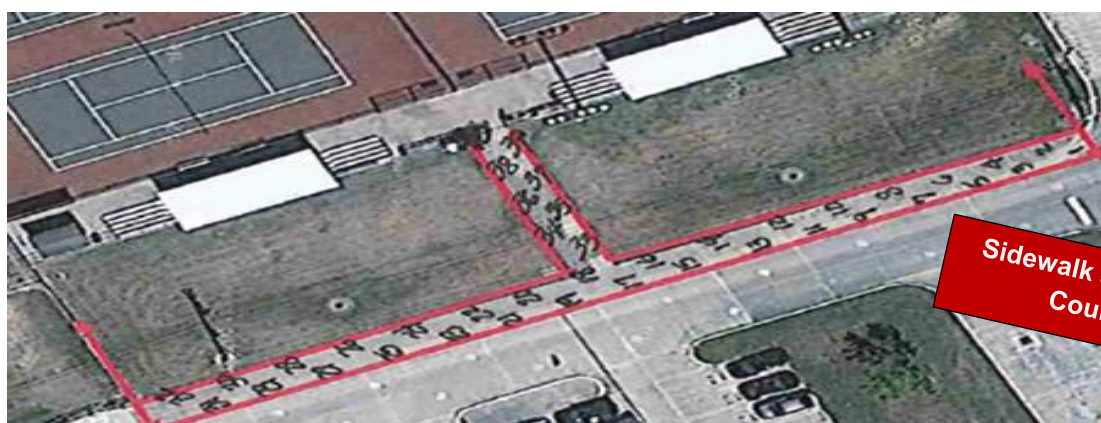
Sidewalk along Tennis Court area