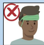
On the forehead