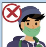
Under the nose