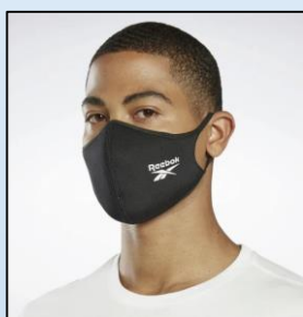
Traditional Cloth Masks (Sports Masks)