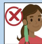
Dangling from ear