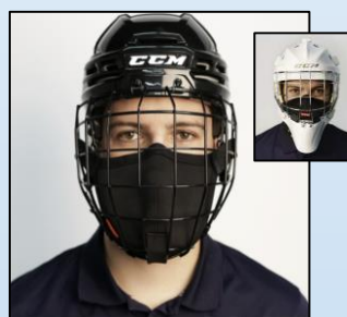
CCM Game On Face Mask (Player & Goalie versions)