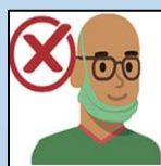
On the chin