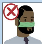
Only on the nose