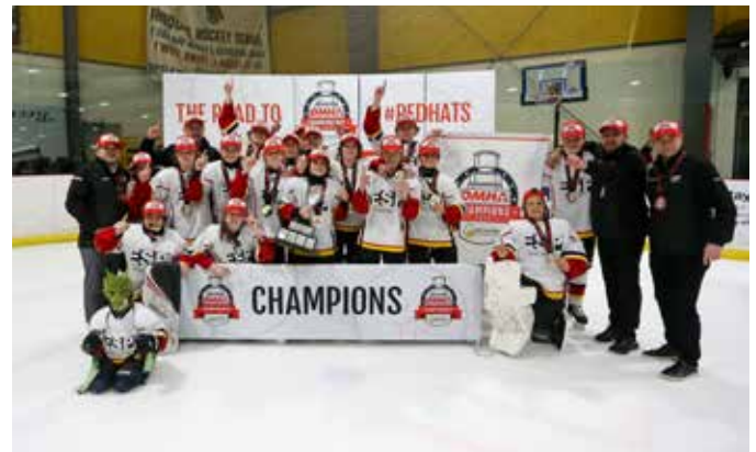
ESSEX-SOUTHPOINT U13 A