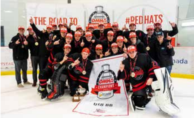
ERIN-HILLSBURGH DEVILS U18 BB