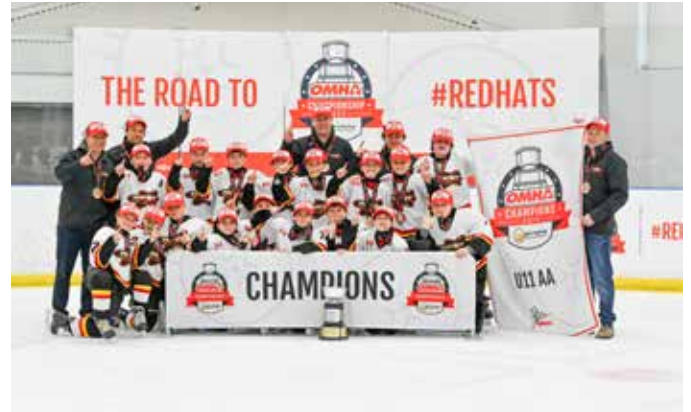
CENTRE WELLINGTON FUSION U11 AA