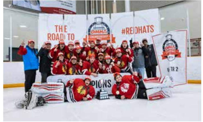
SIX NATIONS BLACKHAWKS U15 TIER 2