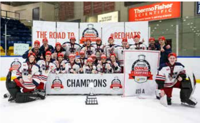
WOOLWICH WILDCATS U15 A