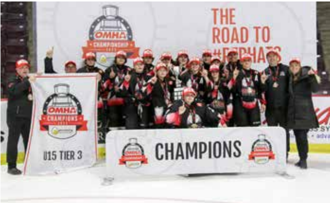
OTONABEE WOLVES U15 TIER 3