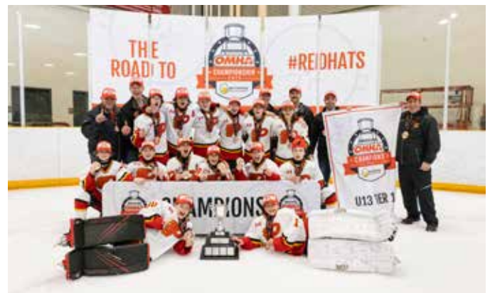
PENETANG FLAMES U13 TIER 1