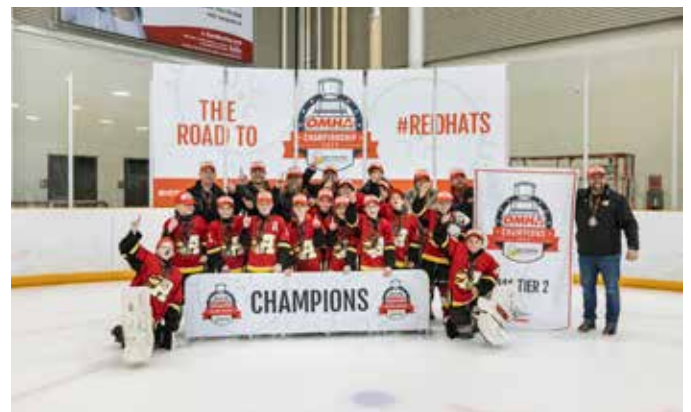
AYLMER FLAMES U11 TIER 2