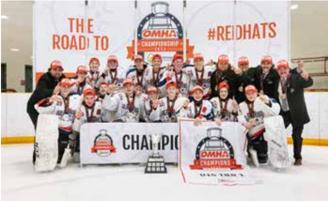
ST. MARYS ROCK U15 TIER 1