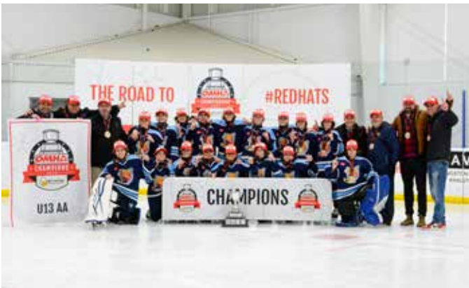
BARRIE JR. COLTS U13 AA