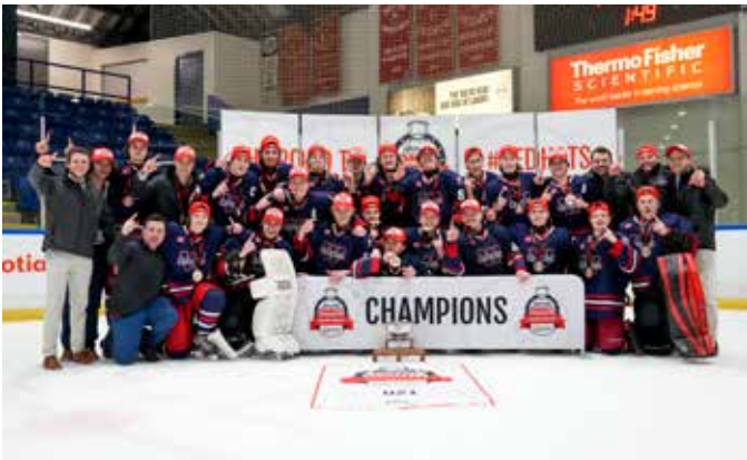
WOOLWICH WILDCATS U21