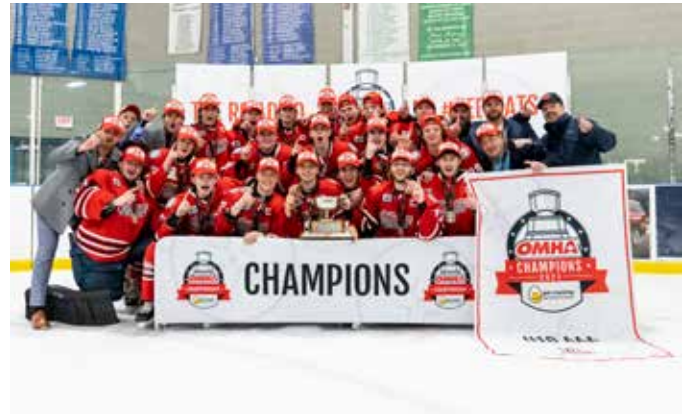
OSHAWA GENERALS U18 AAA