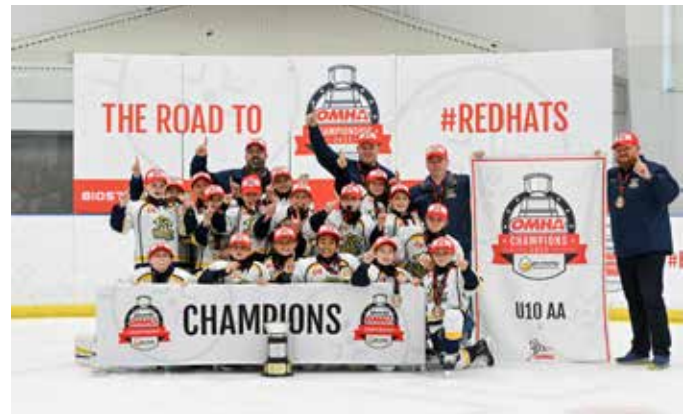
WHITBY WILDCATS U10 AA