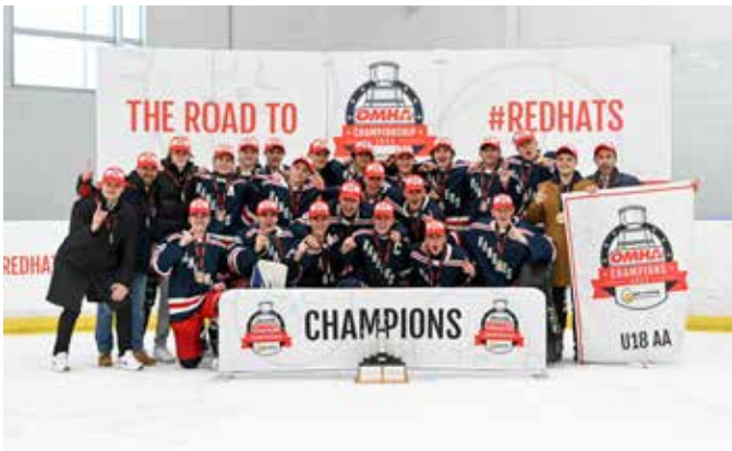
OAKVILLE RANGERS - RED U18 AA