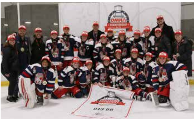
CLARINGTON TOROS U13 BB