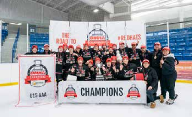
YORK-SIMCOE EXPRESS U15 AAA