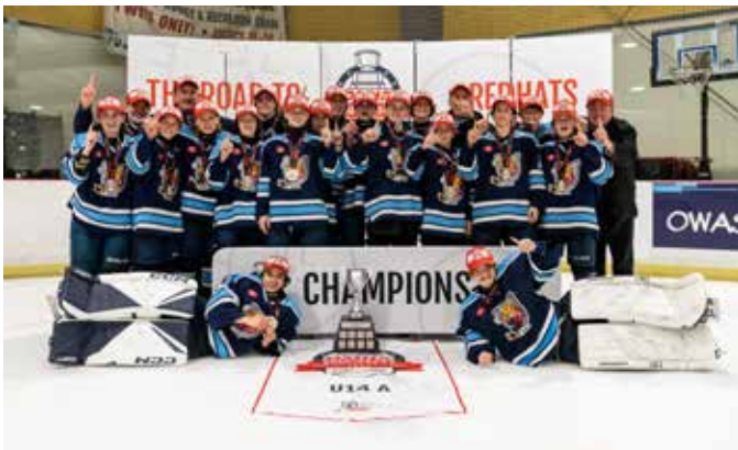
BARRIE JR. COLTS U14 A