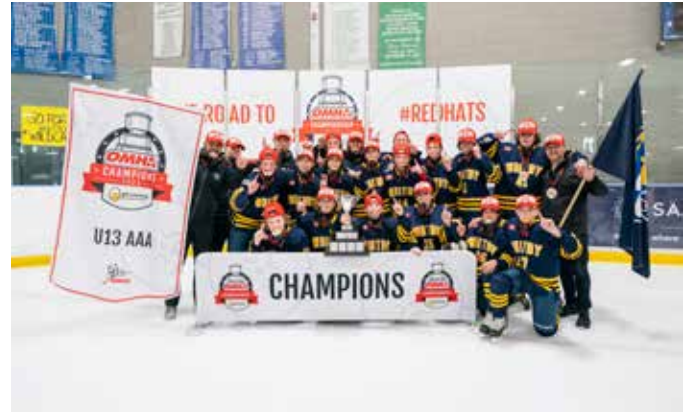
WHITBY WILDCATS U13 AAA