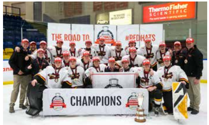
CENTRE WELLINGTON FUSION U18 A