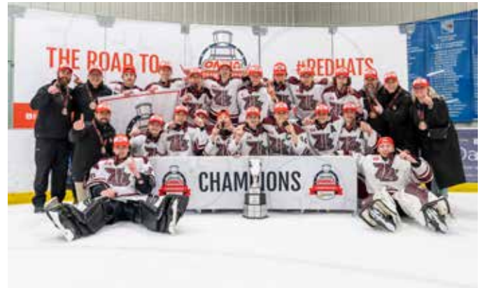
PETERBOROUGH MINOR PETES U16 AAA