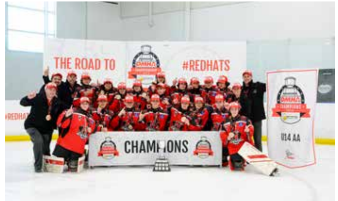
NEWMARKET RENEGADES U14 AA