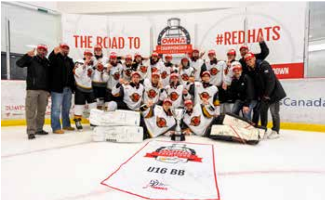
WEST NIAGARA FLYING ACES U16 BB