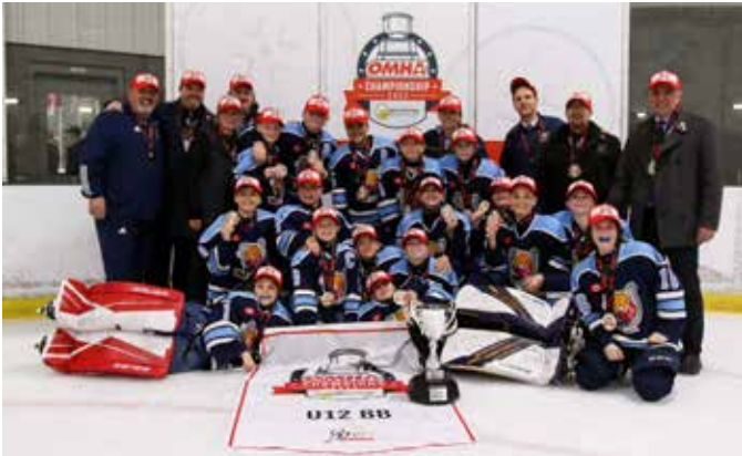
BARRIE JR. COLTS U12 BB