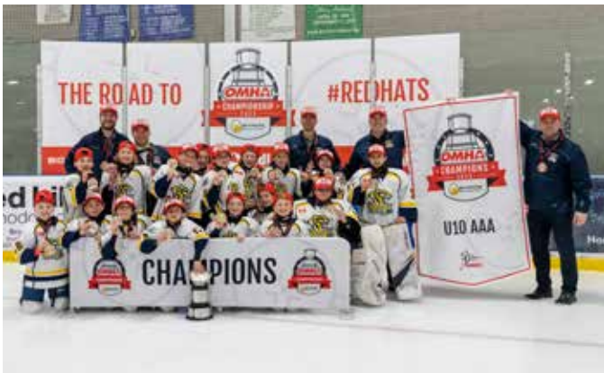
WHITBY WILDCATS U10 AAA

Leading up to the OMHA Championship weekends were League championships and regional qualifying events where teams could punch their tickets to get to these OMHA Championship weekends.