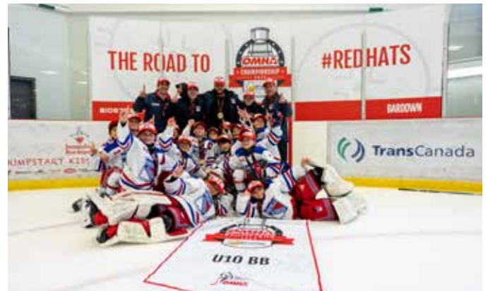
OAKVILLE RANGERS U11 BB