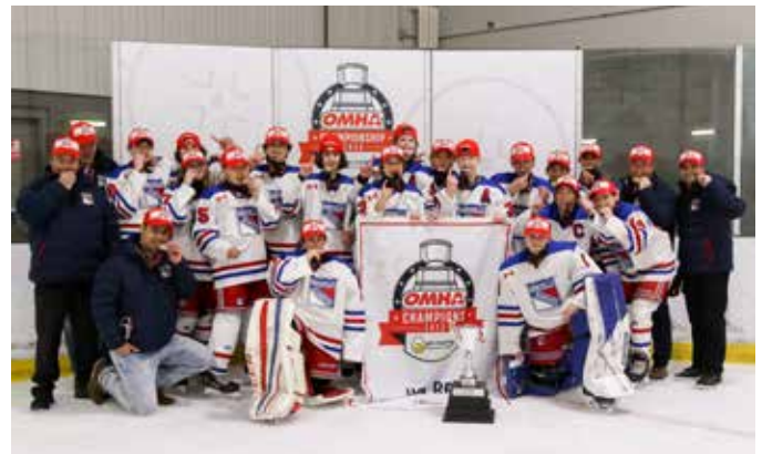
OAKVILLE RANGERS U14 BB