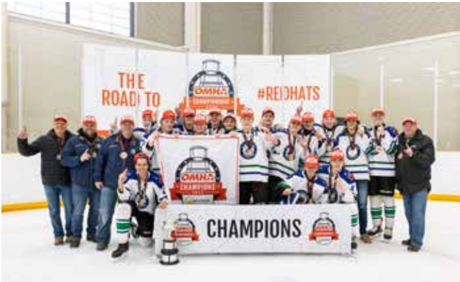
CLEARVIEW CANUCKS U18 TIER 2