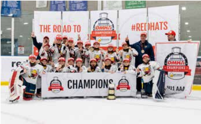
BARRIE JR. COLTS U11 AAA