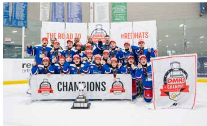
OAKVILLE RANGERS U12 AAA