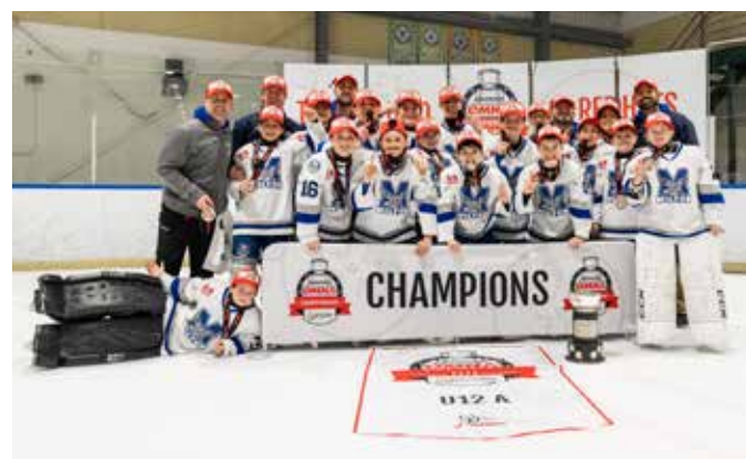
MILTON WINTERHAWKS U12 A