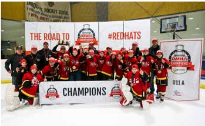
ESSEX-SOUTHPOINT U11 A