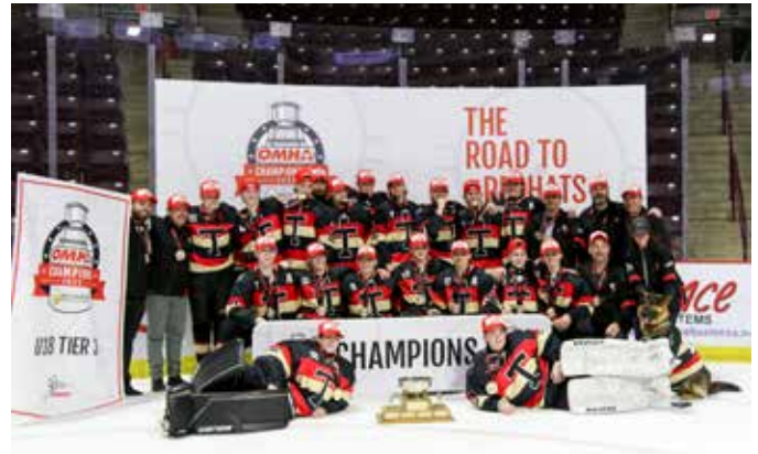
TWEED HAWKS U18 TIER 3