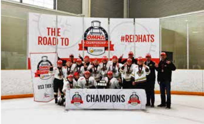
EAST LAMBTON EAGLES U13 TIER 2