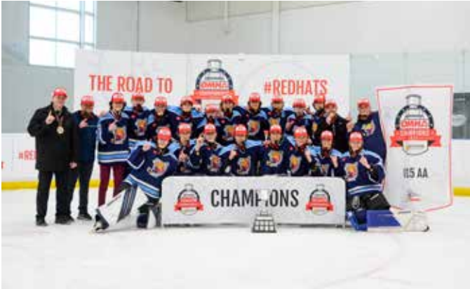
BARRIE JR. COLTS U15 AA