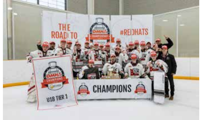
SOUTH MUSKOKA BEARS U18 TIER 1