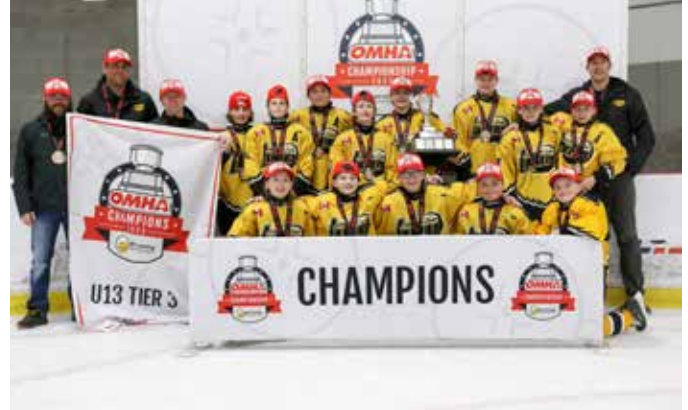
SHALLOW LAKE LAKERS U13 TIER 3