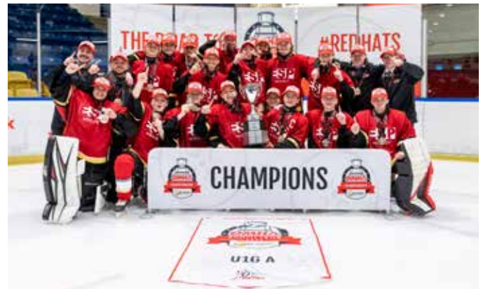
ESSEX-SOUTHPOINT U16 A