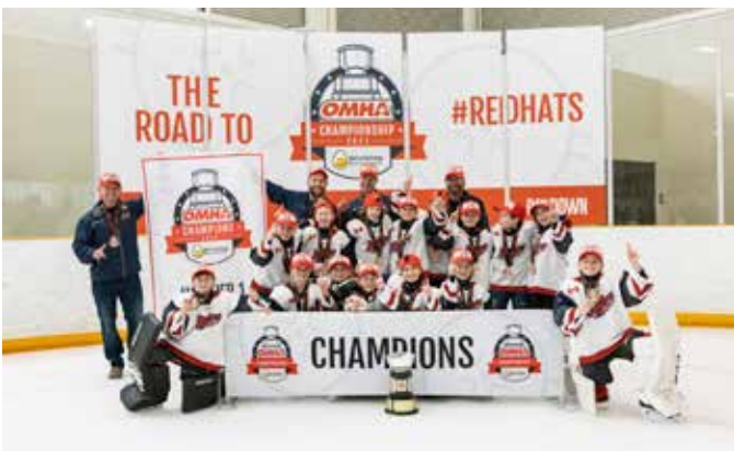
STRATHROY ROCKETS U11 TIER 1