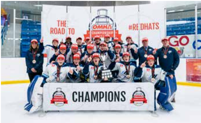
HALTON HURRICANES U14 AAA