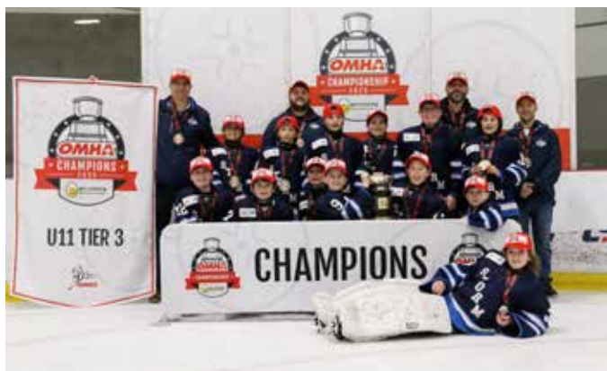
SAUGUEEN SHORES STORM U11 TIER 3