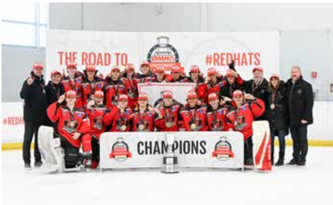
NEWMARKET RENEGADES U16 AA