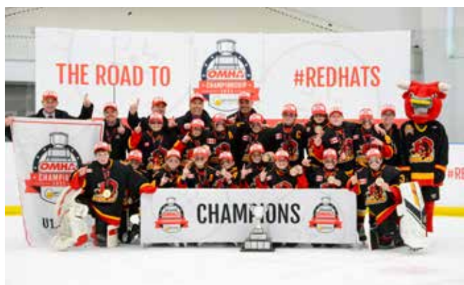
BELLEVILLE BULLS U12 AA