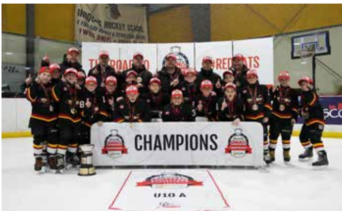
CENTRE WELLINGTON FUSION U10 A