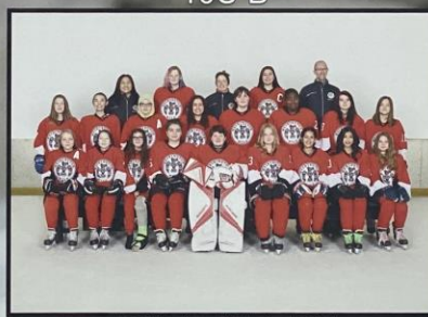
12U / 14U / 16U