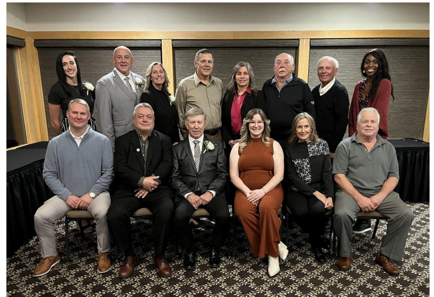
2023 and Past Inductees