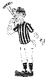
The ump decided the outcome in this game.