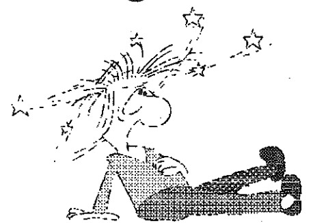
Smack Pack takes a beating from their rivals-the Outsiders.