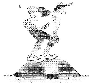
Ikey Yedid and Abie Cohen both pitched well in this pitcher's duel.