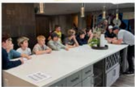
LEARNING, GROWING, AND PLAYING TOGETHER