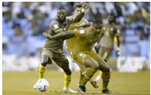
Colour vision deficiency simulation where it is very difficult to distinguish opposing players.