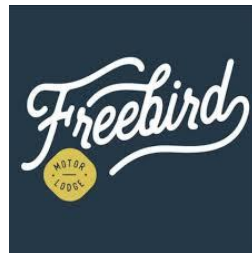
League Partner Freebird Motor Lodge West Yarmouth, MA