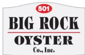
Team Sponsor Big Rock Oyster Co Harwich, MA