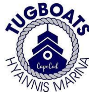
Classic Partner Tugboats Restaurant Hyannis, MA