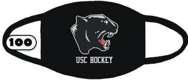
Big Logo Center