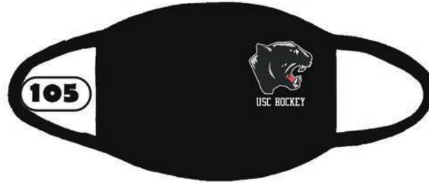
Small Logo Side