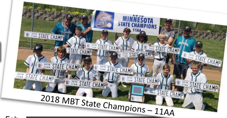
2018 MBT State Champions – 11AA

Coach Registration is open. If you have interest in coaching, you can do so at the following location on our website. RYBA Travel>Travel Info Zone>Coaches Head coaches will go through an interview process at in February. Coaches are not chosen until AFTER the player tryout process is completed.