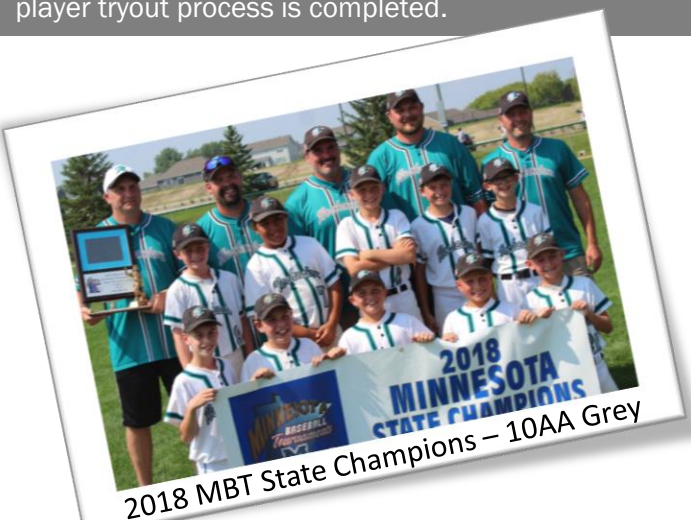
2018 MBT State Champions – 10AA Grey

5. In early December, the Travel Committee completed registering anticipated teams in next summer's tournaments. Tournaments are predominantly in the south metro area to help families limit hotel expenditures as much as possible. The committee made every effort to secure tournament confirmations as soon as possible to assist family summer plan preparation. It also placed as many tournaments for each age group on the same week(s) so regardless of the team your player is on, you will still know well in advance what weekends are scheduled with baseball tournaments. The tournament schedule will be announced after all confirmations are received.