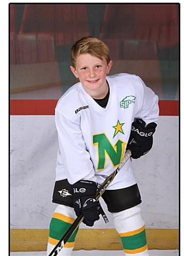
examples of "ready pose"