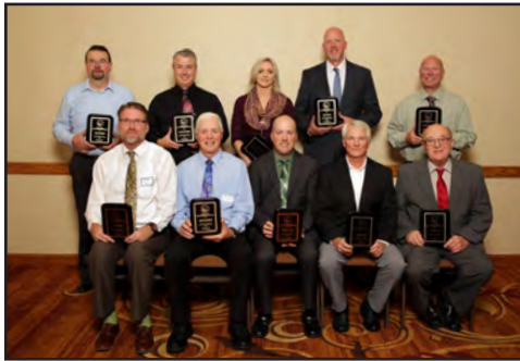
25 Year Service