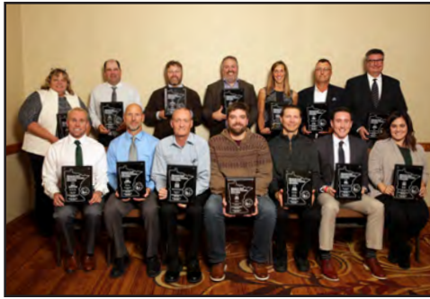
Champion/Coach of the Year