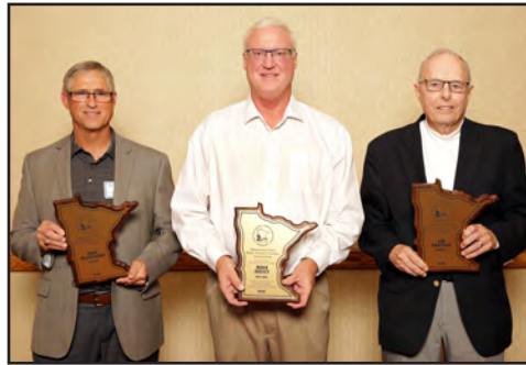
Asst Coach Distinguished Service