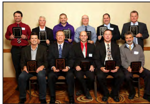
Coach of the Year