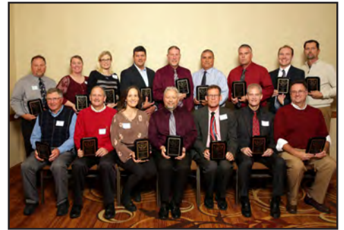
Asst Coach of the Year