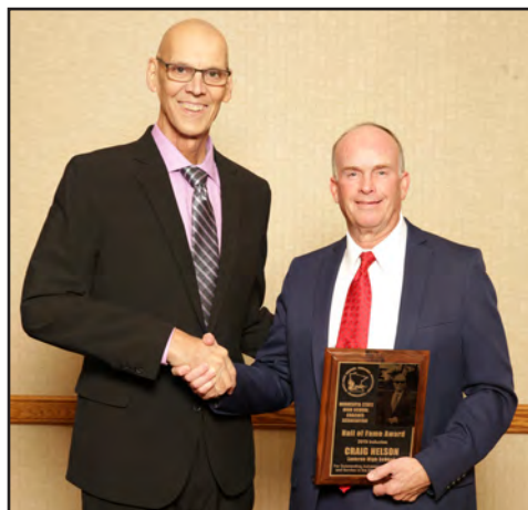
Hall of Fame - Craig Nelson