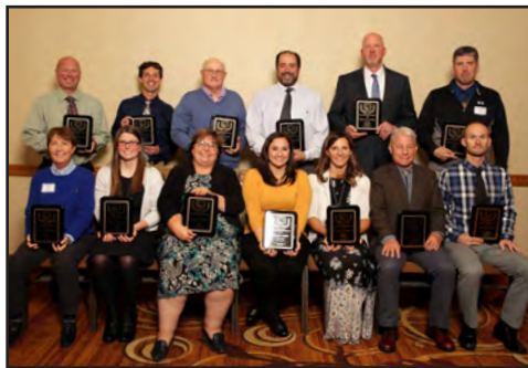
Coach of the Year