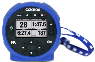
NK CoxBox GPS: $988