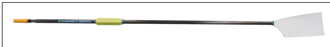
Concept2 Oar: $330 - $425