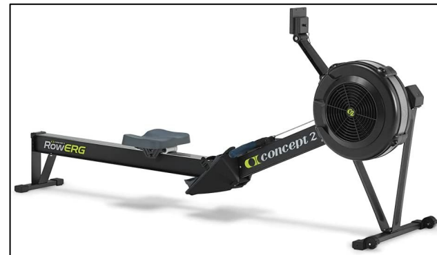
Concept2 RowErg: $950