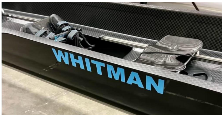
New 8+ Boat: $46,000