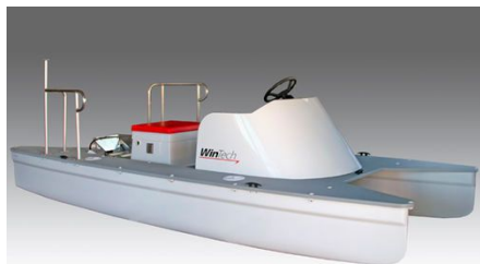
Coach Launch: $20,000