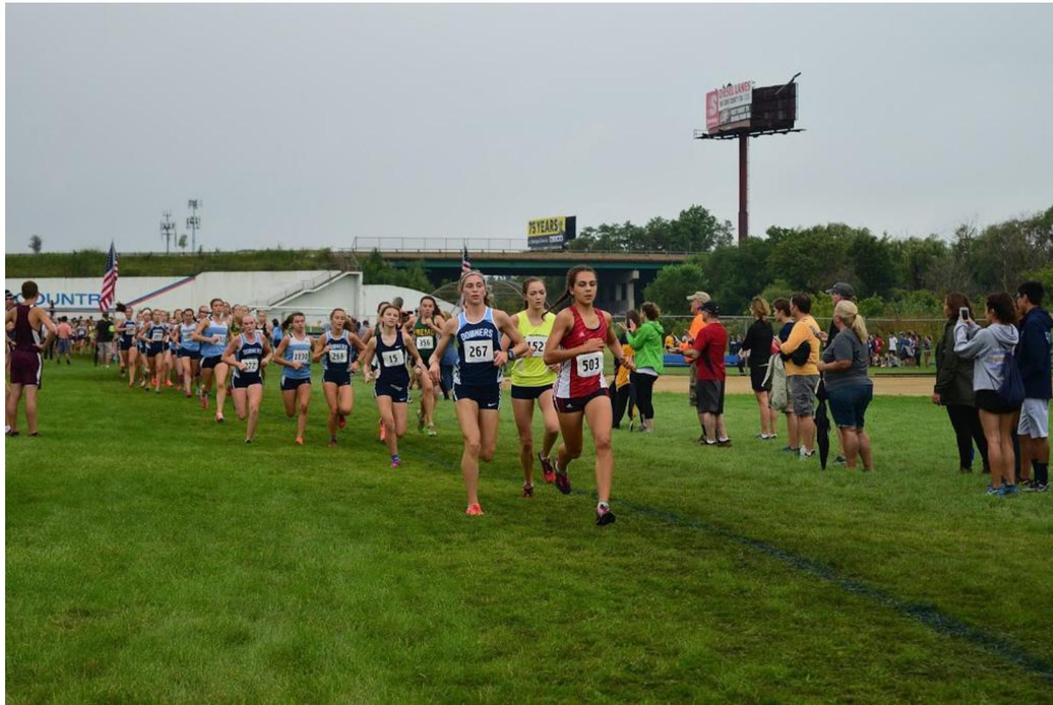
Girls Cross Country