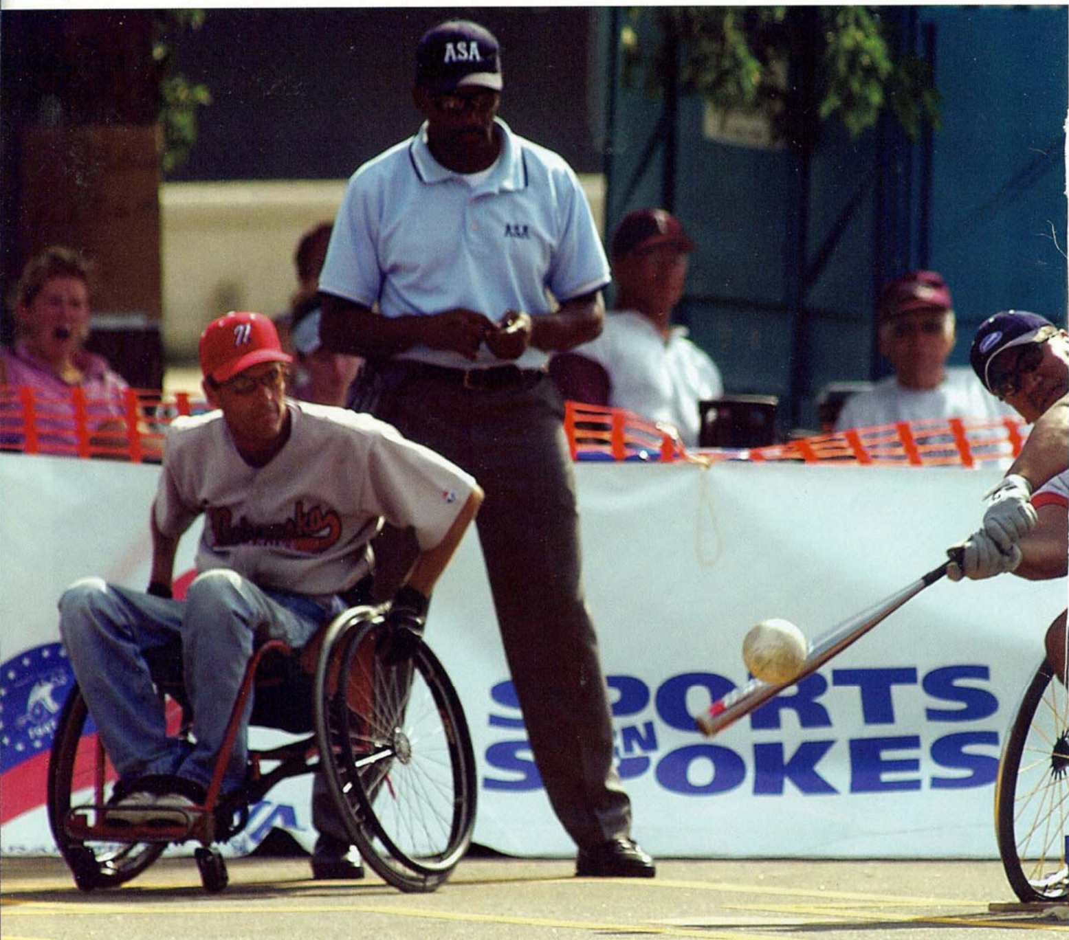
In a come-from-behind championship victory, the Nebraska Barons defeated the Minnesota Twins-East Metro, 8-7.

another historical footnote when they took the field against the American Divas, the first all-women's softball team (see "Divine Divas," next page).