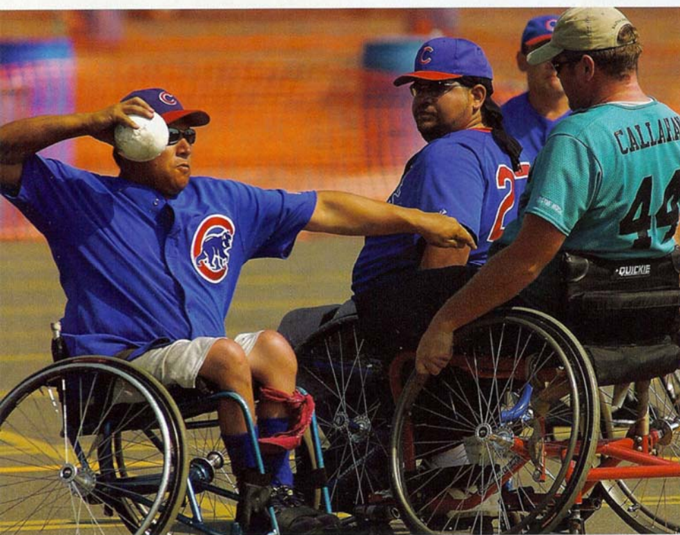
The Chicago Cubs, last year's champions, fell to eventual finalists TC United.

With United, Cubs, and Thunder temporarily out of the way, Nebraska and East Metro stood directly in each other's path to the championship round—one a veteran ball club with a decade-long legacy, the other the proverbial upstart that