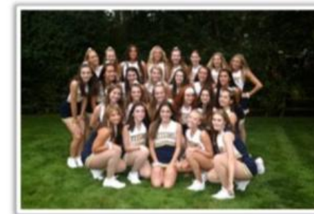
The Varsity Titan Poms