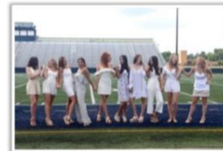
Come join in on the fun!

Register on our website under Special Events at www.titanpoms.weebly.com