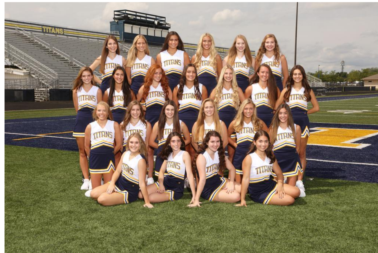
Titan Poms Dance Intensive

The Titans play their final game of the season Friday, October 19, on the road against New Trier.