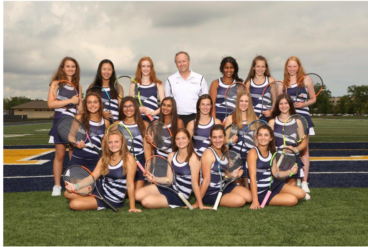
Titans Helping Titans