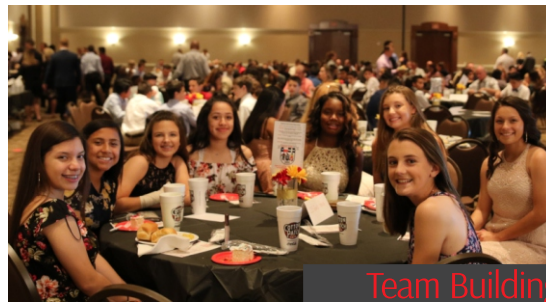
Team Building Skills