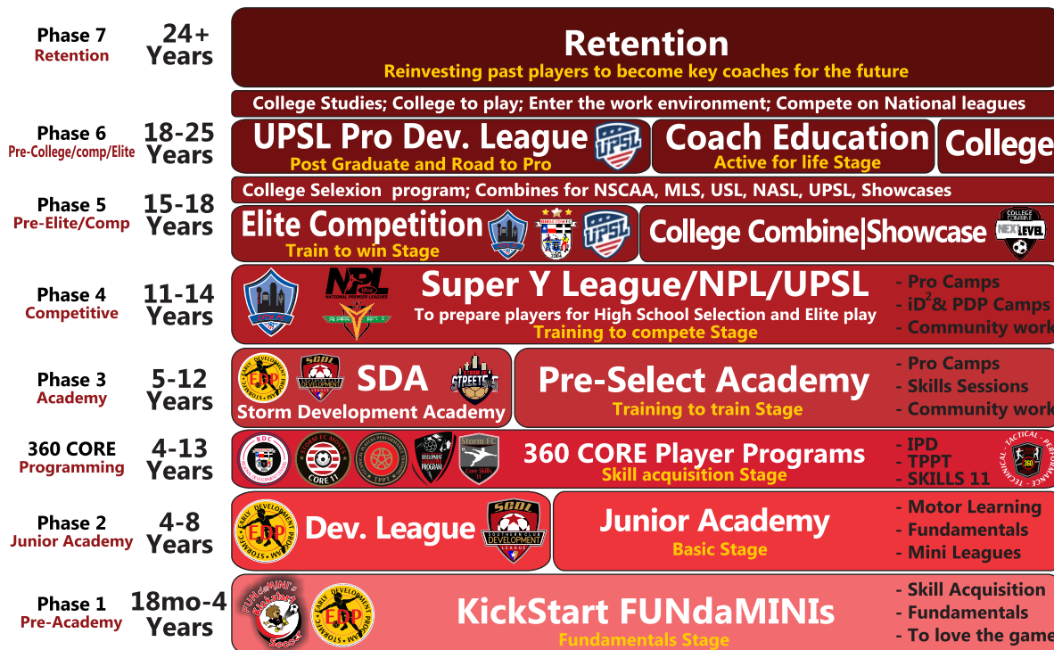
Fig 5: Storm FC player pathway model