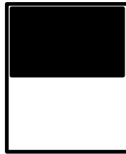
Half Page Horizontal