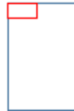
Business Card 2x3