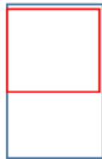
½ Page 8.5x5.5