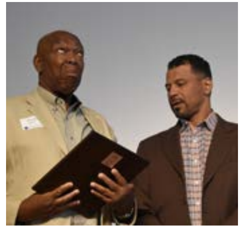
LEROY KEYES (left) and ROD WOODSON share a rare moment on stage during the NFF Honors Dinner last June as Woodson was inducted into the Indiana Football Hall of Fame. Keyes, who was inducted in 2012, and Woodson are two of Purdue’s all-time greatest football players.

Following a stellar high school career at Fort Wayne Snider where he was a two-time USA Today Prep All-American, two-time Indiana All-State choice and the 1982 Indiana Mr. Football, Woodson became a four-year starter, three-year first-team All-Big Ten star and Consensus All-American at Purdue, playing 1983-86. He went on to become one of the greatest defensive backs in NFL history, playing 17 years with Pittsburgh, San Francisco, Baltimore and Oakland. He played in the Super Bowl with three different teams, was named to 11 Pro Bowls and was picked for the Pro Football Hall of Fame in 2009, followed by the College Football Hall of Fame in 2016. Like Flowers, he went into Purdue’s Hall of Fame in 2003. He is now an assistant coach for the