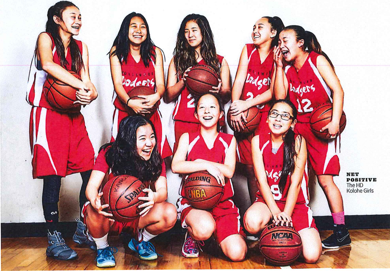
NET POSITIVE The HD Kolohe Girls