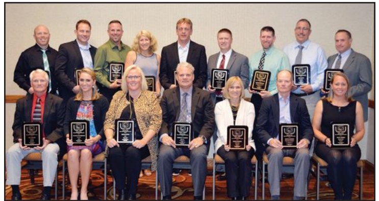
COACH OF THE YEAR