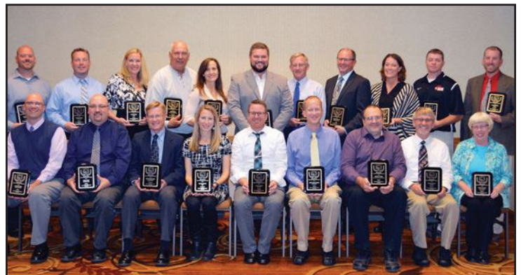
ASSISTANT COACH OF THE YEAR