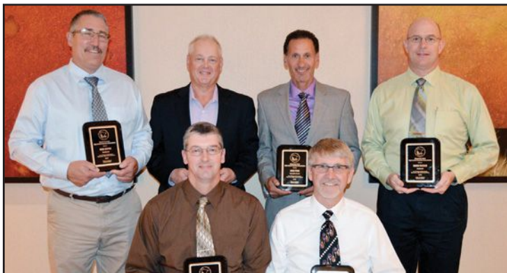
25 YEAR COACHES