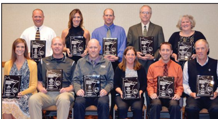
CHAMPIONSHIP COACH AND COACH OF THE YEAR