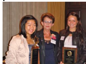
Marlys Larson Award Team Braemar Junior Team highest qualifying competition placement