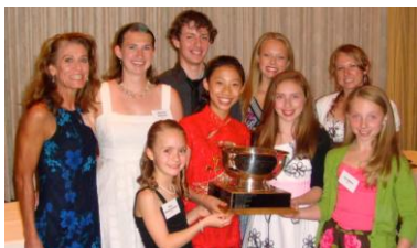
Wakefield Trophy St Paul FSC TCFSA Club with the most placement points