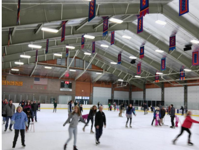
Busy Public Skate!