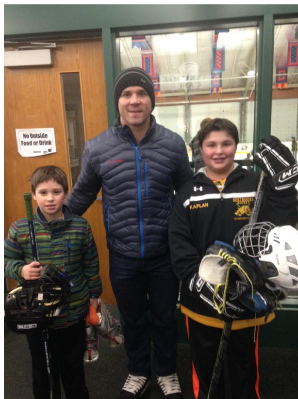
A very special guest, Marty St Louis playing Stick and Puck!