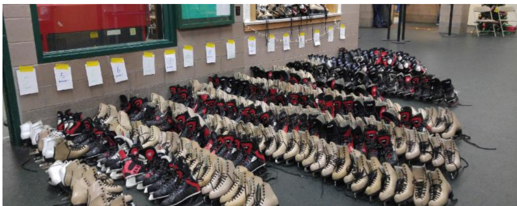
Skates brought back and ready to rack!