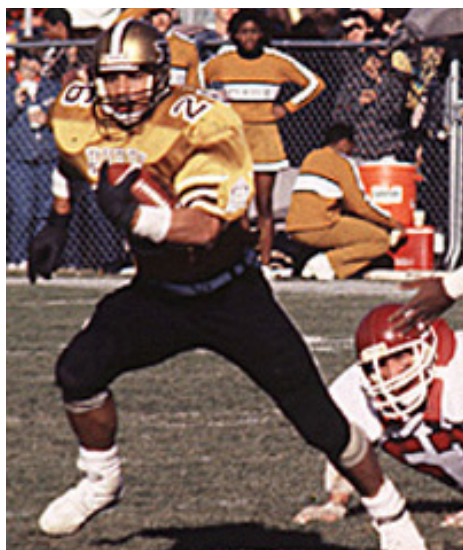
ROD WOODSON - VS. Indiana, Nov. 22, 1986