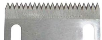
Regular Tape Head