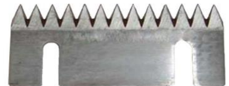
Piranha Tape Head